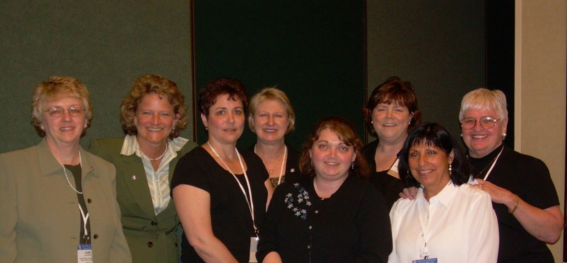
2006 Coordinators' Executive Committee