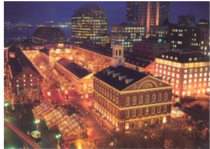
Historic Faneuil Hall Marketplace